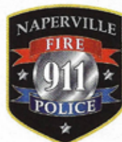
CAPS Citizens Appreciate Public Safety

The Chicago Association of REALTORS® presented Naperville Bank & Trust with the 2013 Good Neighbor Award ("GNA") for the renovation of the Naperville post office into their newest bank location. The GNA was created